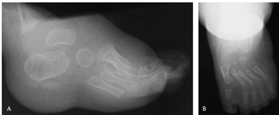
Fig 2 A–B. The radiographs show a 5-month-old infant with complex clubfoot. (A) The foot is in equinus, and all the metatarsals are in severe plantar flexion. (B) There is excessive abduction of the metatarsals caused by faulty manipulation and casting.

deformity worsened. To prevent slippage of the plaster cast, hyperflexion of the metatarsals and rigid equinus were corrected simultaneously by grasping the foot by the ankle with both hands while the thumbs under the metatarsals pushed the foot into dorsiflexion as an assistant stabilized the knee in flexion. Care was taken not to hyperabduct the metatarsals and hindfoot (Fig 5). To immobilize the foot in the corrected position, a plaster splint was applied over the calf, heel, and sole, reinforced by a well-molded plaster bandage. Similarly, the knee was immobilized in at least 110° flexion by applying a plaster splint in front of the knee, reinforced by a plaster bandage around the thigh, avoiding excessive plaster behind the knee and in front of the ankle. Patients required an average of five casts (range, 1–10 casts) for full correction. All patients had a tendo Achillis tenotomy to correct equinus.