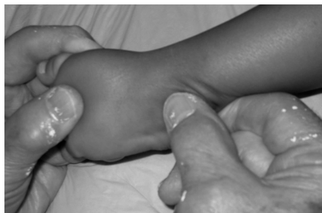
Fig 4. A photograph shows the hand position for manipulating and holding a complex clubfoot. The index finger should rest over the posterior aspect of the lateral malleolus while the thumb of the same hand applies counter pressure over the lateral aspect of the head of the talus.