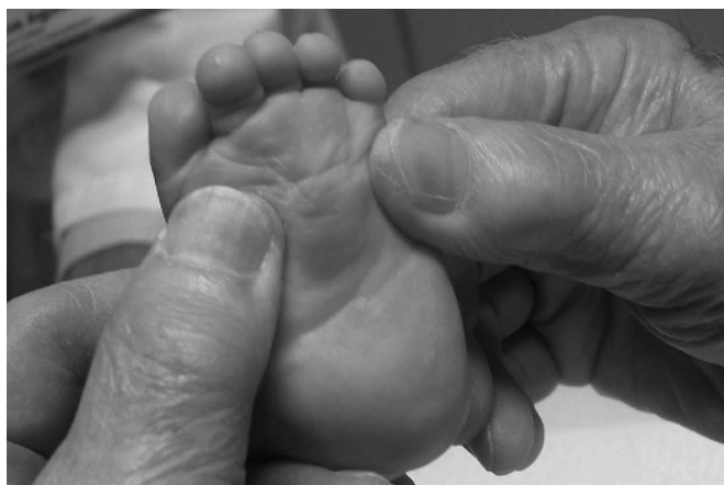
Fig 5. A photograph shows a modification of the manipulation technique for treatment of complex clubfoot. All metatarsals are extended simultaneously with both thumbs while the forefoot is mildly abducted. The heel also is dorsiflexed and slightly abducted.

number of plaster casts, previous tendoachilles tenotomy or lengthening, correction of the deformity components, degree of ankle dorsiflexion after tenotomy, need for a second percutaneous tendo Achillis tenotomy, complications with casting, compliance with the foot abduction brace (assessed based on parents' reports), the need for extensive soft tissue releases, and the occurrence and treatment of relapses.