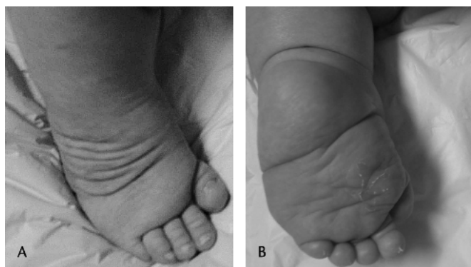
Fig 1A–B. The photographs show a 3-month-old infant with complex clubfoot. (A) Complex clubfeet have a characteristic rigid equinus and a short and hyperextended first toe. (B) Also present are a transverse crease in the sole of the foot and another deep crease above the heel.