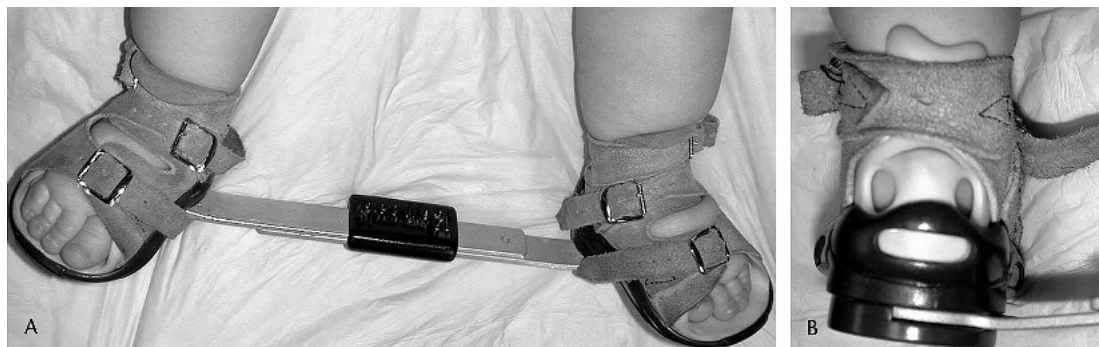
Fig 6A–B. A photograph shows the premolded foot-ankle abduction brace for treatment of complex clubfeet. (A) There are three straps to hold the foot firmly in the sandal. (B) Two openings at the heel allow the parents to see that the hindfoot is correctly placed.

Orthopaedists familiar with the treatment of congenital clubfoot know a small percentage of clubfeet are stiff and resistant to manipulation. 10–13 However, the tissues usu-